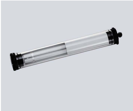
RL70CE - 118